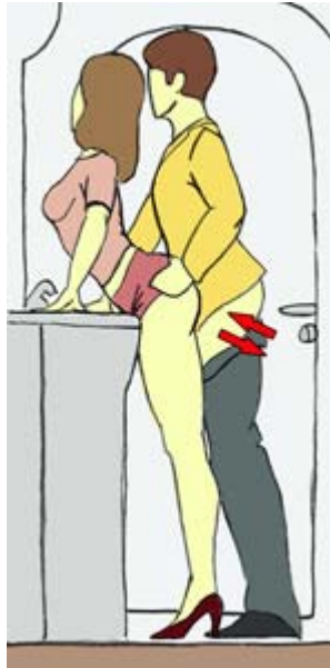
Intercourse - Doggy-Style Against Sink Save time by using this position to wash your hands or fix your makeup while having sex.